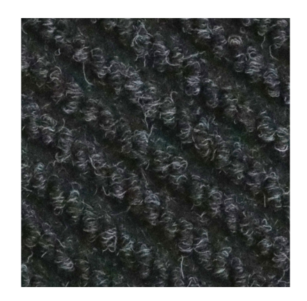
Wyoming - Charcoal